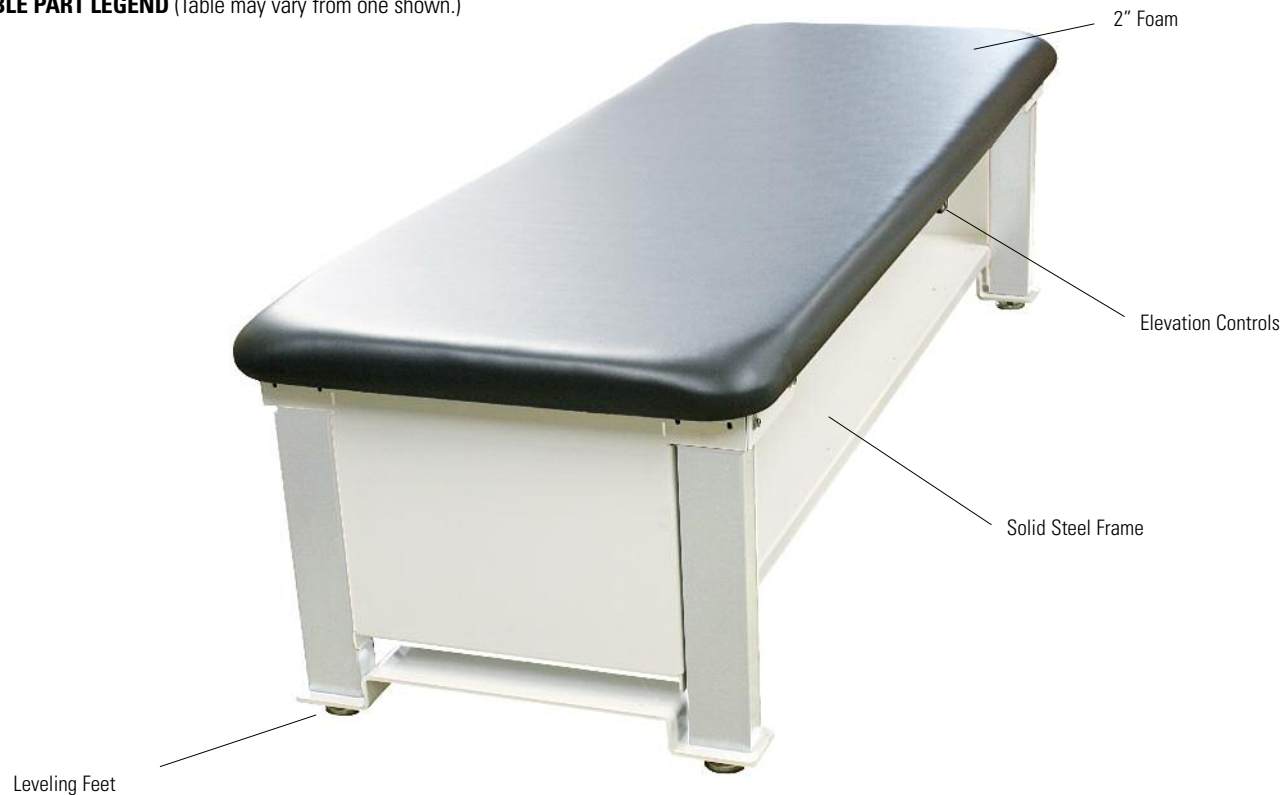
TABLE PART LEGEND (Table may vary from one shown.)